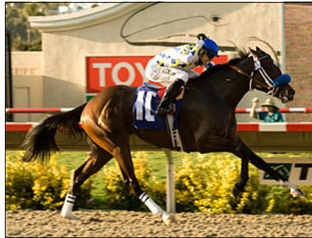
MI SUEÑO CRUISES TO VICTORY AT DEL MAR!